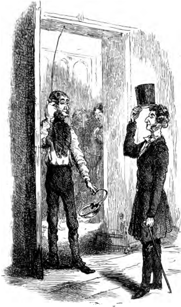
THE GENERAL'S SALUTATION OF THE MAJOR